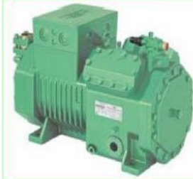
DWM Copeland Condenser