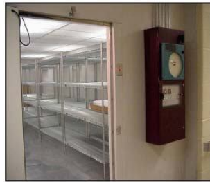
Pharmaceutical Laboratory Rooms